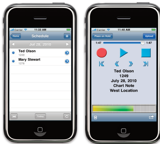
With the mobile app, physicians can upload schedules (left), create dictations, and review and approve transcriptions (right).

From there, Emdat forwards the data files to a MT where DaRT takes over, automatically inserting the data into the EMRs as the MTs type the dictation into the Emdat platform using Emdat's InScribe technology. The DaRT technology works by identifying distinct information such as symptoms and labs contained in the notes and filling the proper fields